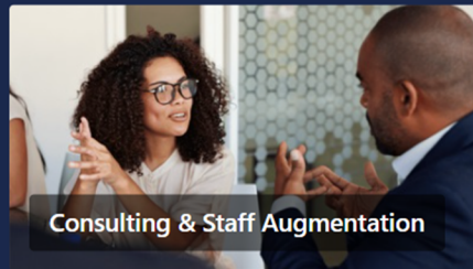
Consulting & Staff Augmentation