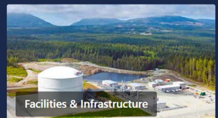
Facilities & Infrastructure