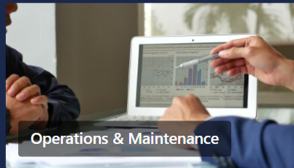
Operations & Maintenance