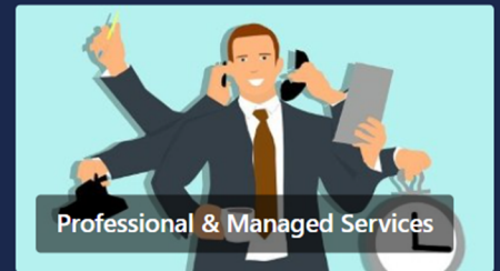
Professional & Managed Services